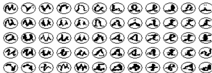
Fig. 4. Feature map with 5 rows and 12 columns generated for 21 classes

The advantages on the use of non-supervised generation of feature maps for an ill-defined set of patterns have been shown in these results. The behavior of SOFM network for the experiments executed in this research was as expected, creating well defined prototypes, and being able to classify better than a popular supervised algorithm. Future research work may include the determination of heuristics to help with the definition of the best topology of the feature maps, and the inclusion of weights in the feature maps marking the importance of each feature prototype, based on the frequency of patterns in the training set.