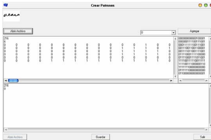
Fig. 3. Building patterns from .gif files. In the top left the original word is shown; the map bit at the right shows the normalized pattern of the first character