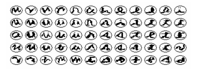
Fig. 4. Feature map with 5 rows and 12 columns generated for 21 classes

The advantages on the use of non-supervised generation of feature maps for an illdefined set of patterns have been shown in these results. The behavior of SOFM network for the experiments executed in this research was as expected, creating well defined prototypes, and being able to classify better than a popular supervised algorithm. Future research work may include the determination of heuristics to help with the definition of the best topology of the feature maps, and the inclusion of weights in the feature maps marking the importance of each feature prototype, based on the frequency of patterns in the training set.